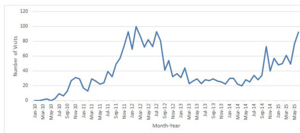
ED and UCC Visits Related to Synthetic Marijuana, Florida, January, 2010 - June, 2015, by Month